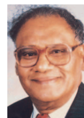
Prof. C. N. R. Rao